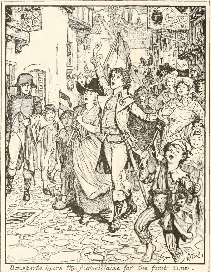
Bonaparte hears the Marseillaise for the first time.

with generous feelings and a strong sense of duty, which in after-years, when he was King of Holland, brought